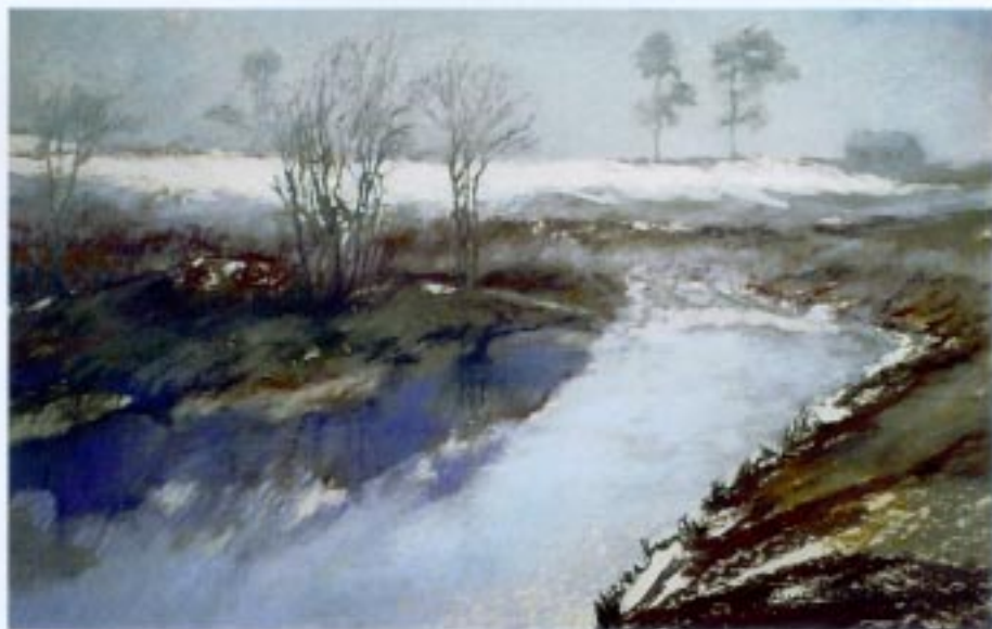
"Cranberry Bog with Barn," 18" x 25"

Where is north? Where will the sun be in 20 minutes, an hour? And where will the shadows be then? What is the underlying form of the landscape? When I understand the underlying form, the voice of the landscape becomes my artistic voice.