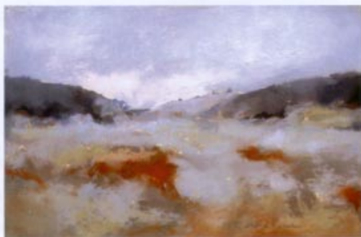
"Truro Locusts I," 29" x 24"